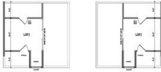
2ND FLOOR LOFT PLAN